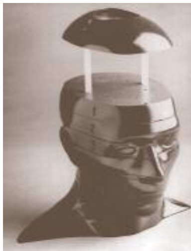
Figure 1: RANDO phantom

In this experimental crossover study a head RANDO phantom (Radiation Analog Dosimetry System, Alderson Research Lab, Inc. Stamford, Connecticut) was used (Figure 1).